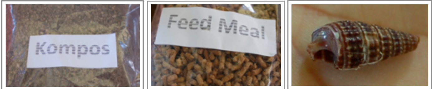
Additional cash flows generated from the processing of Gracilaria: compost, animal feed, and shells to be converted to \text{CaCO}_3

ago. However its popularity is dependent on the removal of its 214 bones. Unless the bones are removed the fish ends up as cat food.