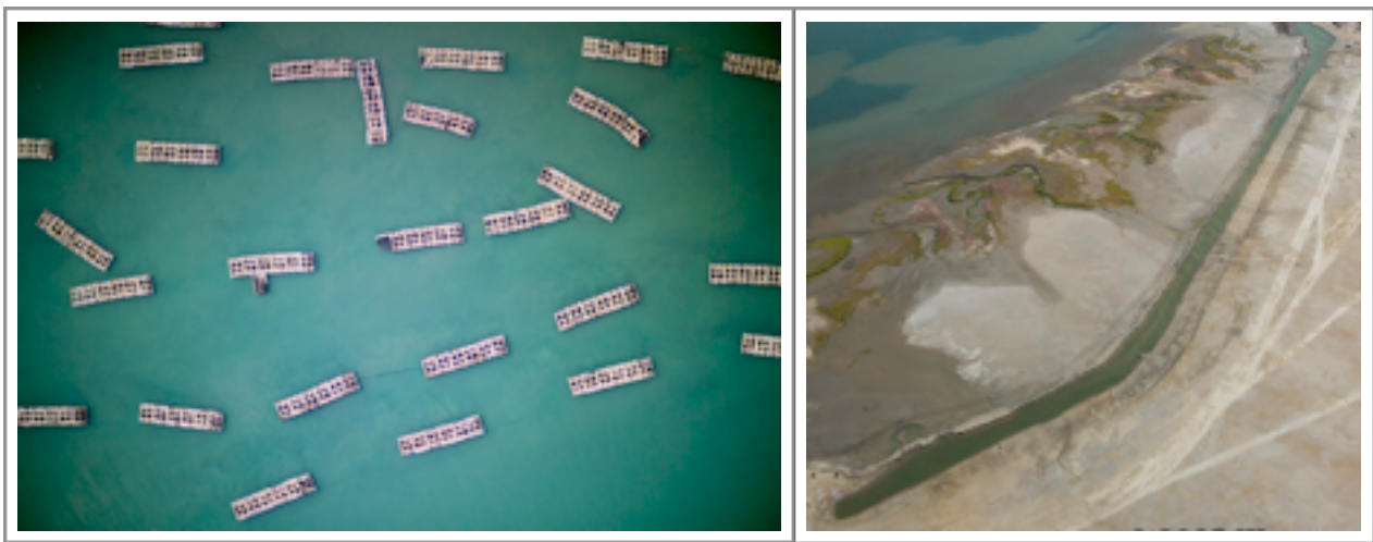
Oyster farming and seaweed harvesting in Lüderitz (Namibia)

coastal tip of Namibia. There his company farmed, harvested and processed Gracilaria verrucosa into raw material for agar and garnish for sushi, Ecklonia maxima (the giant brown kelp) for the production of alginates, and an excellent moisture retainer in agriculture, as abalone feed and raw material for fertilizer; Gelidium pristoides for the production of bacteriological agar; and, Laminaria pallida kelp for the extraction of medical products. It was this small biochemical company in Namibia, with its farming and harvesting in along the coast influenced by the cold Benguela Current with business units from Namibia to Saldannah Bay in the Western Cape of South Africa that introduced me to the rich portfolio of chemicals that could be derived from seaweeds.